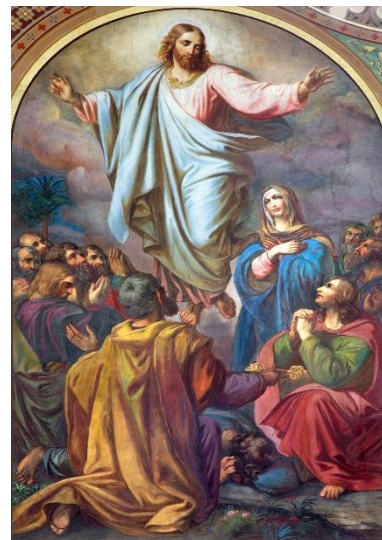
The Ascension of Jesus

“Now of these Enoch also, the seventh from Adam, prophesied, saying: Behold, the Lord cometh with thousands of his saints, to execute judgment upon all, and to reprove all the ungodly for all the works of their ungodliness, whereby they have done ungodly, and of all the hard things which ungodly sinners have spoken against God.” (Jude 1:14 –15)