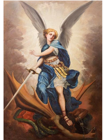
St Michael the Archangel

O my Jesus, forgive us our sins, save us from the fires of hell, and lead all souls to heaven, especially those in most need of your mercy. Amen.