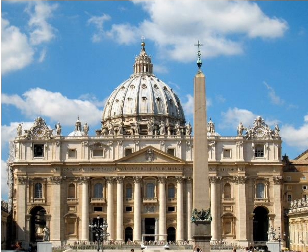
St Peter's Basilica, Vatican City

“Sing ye to the Lord a new canticle: let his praise be in the church of the saints.” (Psalms 149:1)