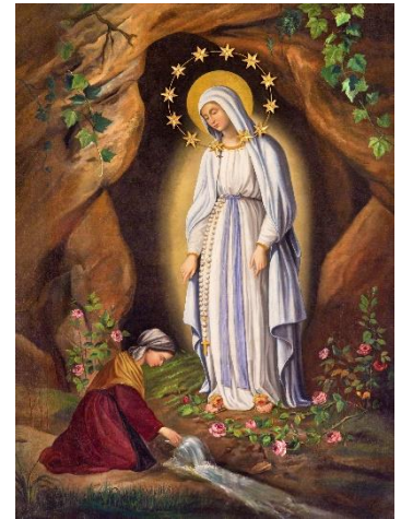
Our Lady of Lourdes

Hail, Holy Queen, Mother of Mercy, hail, our life, our sweetness and our hope. To thee do we cry, poor banished children of Eve. To thee do we send up our sighs, mourning and weeping in this vale of tears. Turn then, most gracious Advocate, thine eyes of mercy towards us, and after this our exile, show unto us the blessed fruit of thy womb, Jesus. O clement, O loving, O sweet Virgin Mary. Pray for us, O Holy Mother of God, that we may be made worthy of the promises of Christ. Amen.